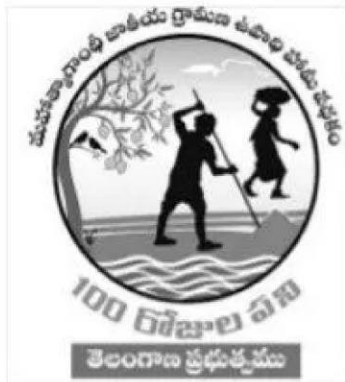
NREGA Telangana Logo

The IT Department was notified of the flaw on Friday and it